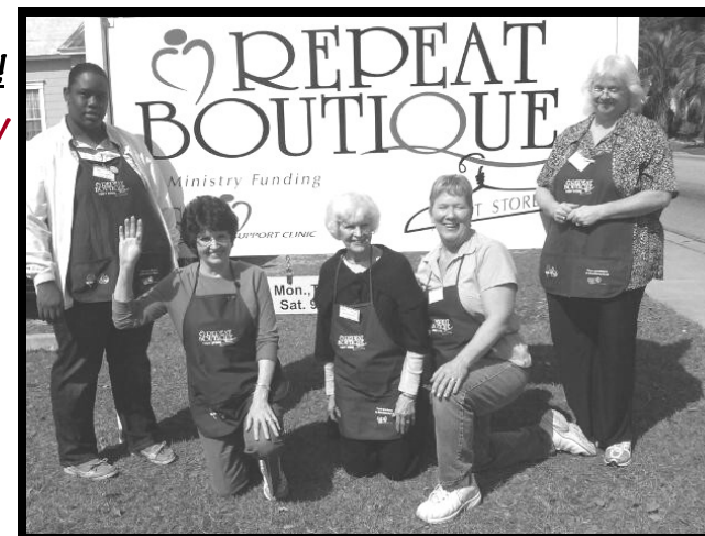
Come see us & be surprised at the treasures you find!

BUILD GOD'S VISION FOR LIFE BY DONATING ONLINE @ WWW.PSCVALDOSTAPARTNERS.ORG !