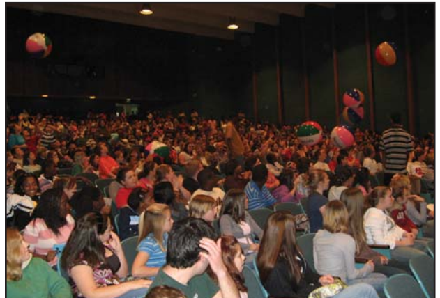
Parents and Students attend Pure Love Conference Kick-off at Mathis Auditorium